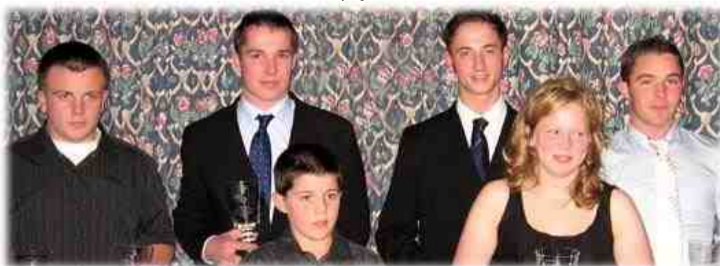
CWWA Trophy winners 2009