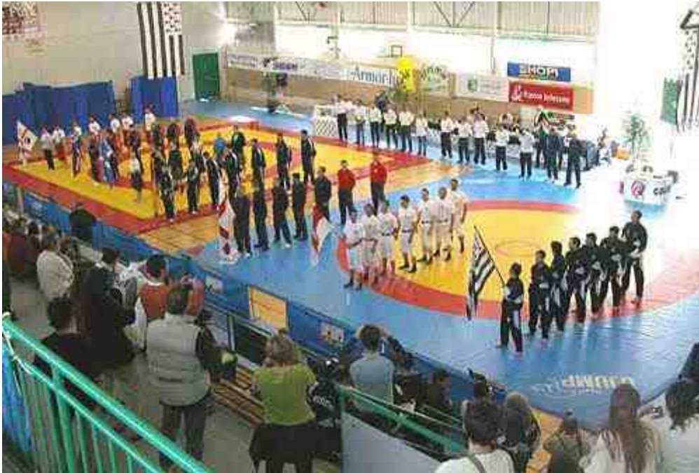
A typical scene at the beginning of IFCW European Championships

( CLICK on thumbnail to see a larger picture - CLICK anywhere EXCEPT on the larger image to return to this page)