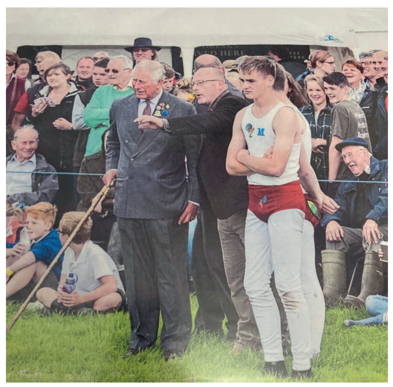
The then Prince of Wales stopped to watch the wrestling at Westmorland Show in 2017